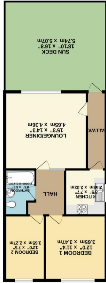
1ST FLOOR 654 sq ft. (60.7 sq.m.) approx.

Measurements have been made to ensure the accuracy of the figures contained here. Measurements of doors, windows, rooms and other items are approximate and no responsibility is taken for any errors in the measurements. The plan is for information purposes only and should be used as a guide only. As to the accuracy of the figures, the purchaser is advised to verify the same.