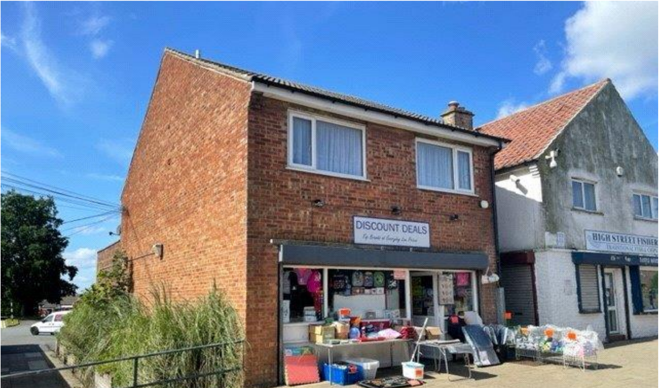
10 & 10a, 10 High Street, Eastfield, Scarborough, North Yorkshire, YO11 3LJ

Harris Shields Collection Planning No. 15/01007/1 15/01007/2 15/01007/3 15/01007/4 15/01007/5 15/01007/6 15/01007/7 15/01007/8 15/01007/9 15/01007/10 15/01007/11 15/01007/12 15/01007/13 15/01007/14 15/01007/15 15/01007/16 15/01007/17 15/01007/18 15/01007/19 15/01007/20 15/01007/21 15/01007/22 15/01007/23 15/01007/24 15/01007/25 15/01007/26 15/01007/27 15/01007/28 15/01007/29 15/01007/30 15/01007/31 15/01007/32 15/01007/33 15/01007/34 15/01007/35 15/01007/36 15/01007/37 15/01007/38 15/01007/39 15/01007/40 15/01007/41 15/01007/42 15/01007/43 15/01007/44 15/01007/45 15/01007/46 15/01007/47 15/01007/48 15/01007/49 15/01007/50 15/01007/51 15/01007/52 15/01007/53 15/01007/54 15/01007/55 15/01007/56 15/01007/57 15/01007/58 15/01007/59 15/01007/60 15/01007/61 15/01007/62 15/01007/63 15/01007/64 15/01007/65 15/01007/66 15/01007/67 15/01007/68 15/01007/69 15/01007/70 15/01007/71 15/01007/72 15/01007/73 15/01007/74 15/01007/75 15/01007/76 15/01007/77 15/01007/78 15/01007/79 15/01007/80 15/01007/81 15/01007/82 15/01007/83 15/01007/84 15/01007/85 15/01007/86 15/01007/87 15/01007/88 15/01007/89 15/01007/90 15/01007/91 15/01007/92 15/01007/93 15/01007/94 15/01007/95 15/01007/96 15/01007/97 15/01007/98 15/01007/99 15/01007/100