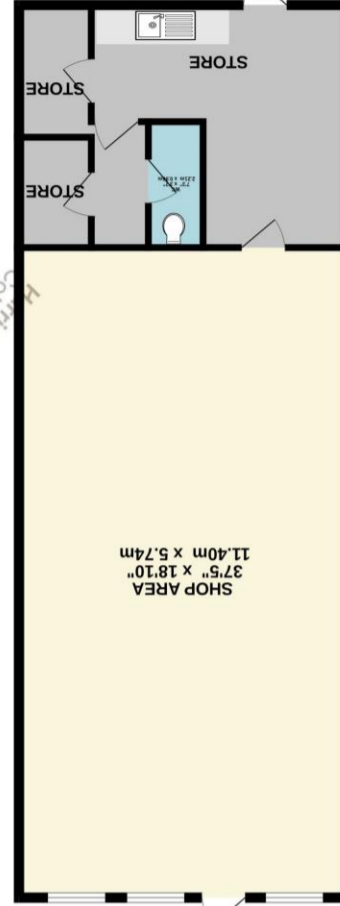
GROUND FLOOR 967 sq ft. (89.8 sq.m.) approx.

Harris Shields Collection Planning No. 15/01007/1 15/01007/2 15/01007/3 15/01007/4 15/01007/5 15/01007/6 15/01007/7 15/01007/8 15/01007/9 15/01007/10 15/01007/11 15/01007/12 15/01007/13 15/01007/14 15/01007/15 15/01007/16 15/01007/17 15/01007/18 15/01007/19 15/01007/20 15/01007/21 15/01007/22 15/01007/23 15/01007/24 15/01007/25 15/01007/26 15/01007/27 15/01007/28 15/01007/29 15/01007/30 15/01007/31 15/01007/32 15/01007/33 15/01007/34 15/01007/35 15/01007/36 15/01007/37 15/01007/38 15/01007/39 15/01007/40 15/01007/41 15/01007/42 15/01007/43 15/01007/44 15/01007/45 15/01007/46 15/01007/47 15/01007/48 15/01007/49 15/01007/50 15/01007/51 15/01007/52 15/01007/53 15/01007/54 15/01007/55 15/01007/56 15/01007/57 15/01007/58 15/01007/59 15/01007/60 15/01007/61 15/01007/62 15/01007/63 15/01007/64 15/01007/65 15/01007/66 15/01007/67 15/01007/68 15/01007/69 15/01007/70 15/01007/71 15/01007/72 15/01007/73 15/01007/74 15/01007/75 15/01007/76 15/01007/77 15/01007/78 15/01007/79 15/01007/80 15/01007/81 15/01007/82 15/01007/83 15/01007/84 15/01007/85 15/01007/86 15/01007/87 15/01007/88 15/01007/89 15/01007/90 15/01007/91 15/01007/92 15/01007/93 15/01007/94 15/01007/95 15/01007/96 15/01007/97 15/01007/98 15/01007/99 15/01007/100